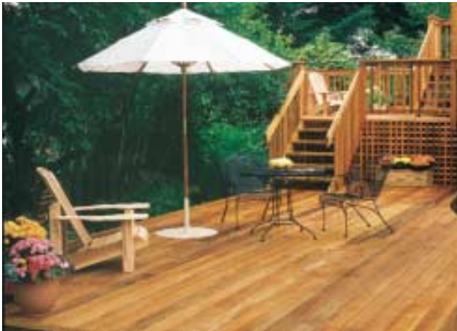
A water-repellent coating helps this cedar deck shed rainwater, contributing to the wood's longevity.

Apply finishes the full length of only two or three boards at a time to avoid lap marks. Do not apply more stain than the cedar will absorb because the excess stain will appear as a shiny area on the surface. For extra protection against mildew, an annual or even semi-annual application of a water-repellent preservative formulated with a mildewcide may be effective.