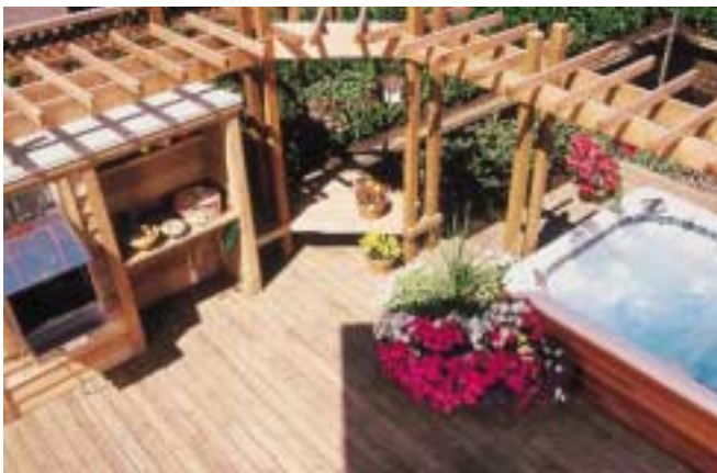
A natural stain applied to all elements of this outdoor living area provides both color and protection.