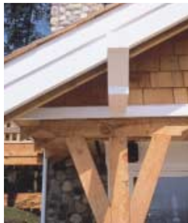
A transparent stain reveals cedar's natural coloration while slowing the color-change process over time.

Uncoated, weathered cedar siding or trim can often be restored to its original color by applying commercial products called cleaners, brighteners or restorers. Although intended primarily for restoring horizontal wood surfaces such as decks, they generally work almost as well on vertical surfaces. Some products are formulated with thickening agents to help the liquid cling better to vertical surfaces. The manufacturer's instructions should be followed for optimum effectiveness. For more information see 'Restoring Deck Finishes' (page 16).