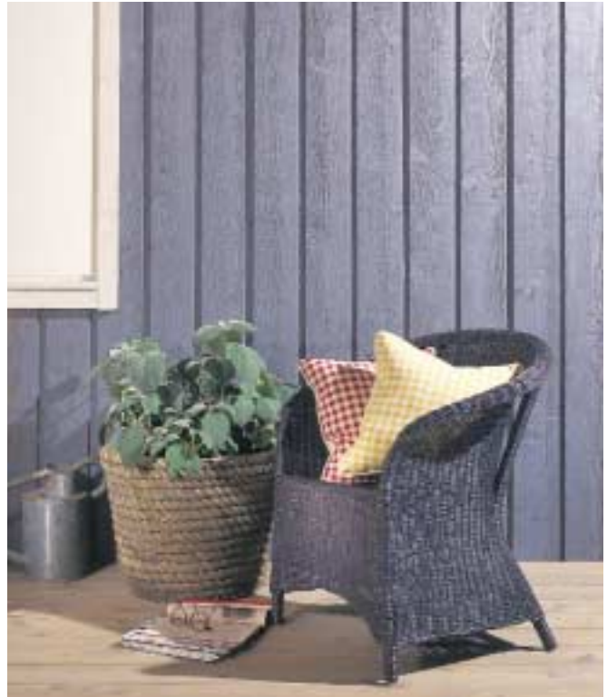
A semi-transparent stain applied to vertical channel siding will weather well in this protected outdoor sitting area.

Solid-color stains are opaque finishes with fewer solids than paint. Available in a wide spectrum of hues, solid-color stains obscure the wood's true color but allow some of the natural characteristics and texture of cedar to remain. Solid-color stains perform best on textured surfaces. They are non-penetrating and, like paints, form a film. A stain-blocking primer should be applied first, followed by a 100% acrylic latex-based top coat.