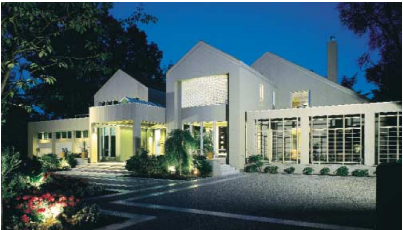
A beautiful one-tone finish for a beautiful cedar-clad home. Creative lighting adds a dramatic dimension to the overall effect.

Unlike paint, a solid-color stain may leave lap marks. To prevent lap marks, follow the procedures suggested for semi-transparent penetrating stains.