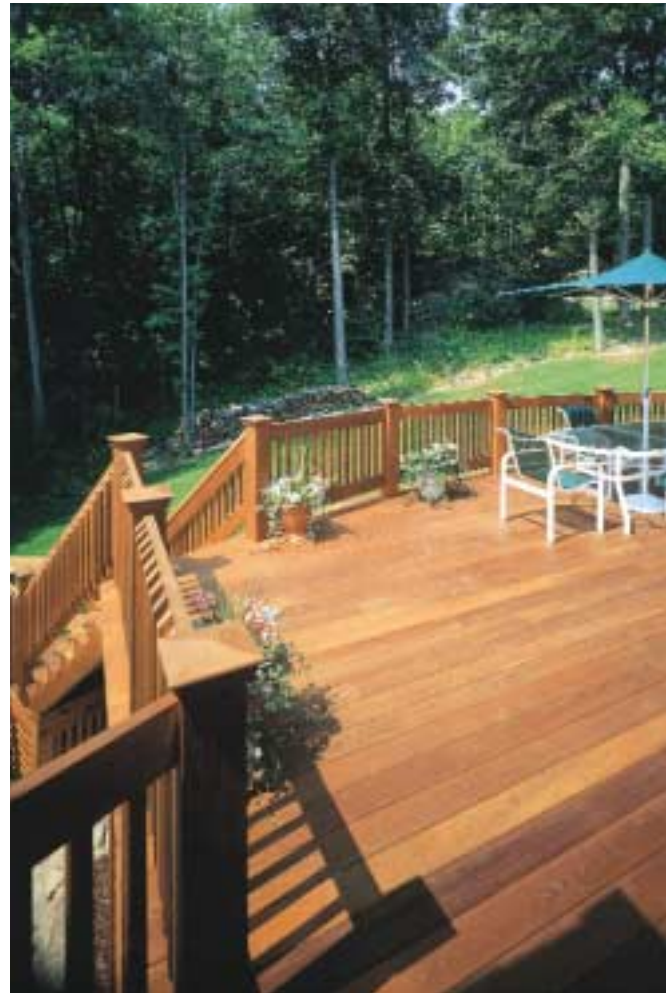
Finishes applied to cedar decks, post and railings should contain a water-repellent, fungicide, mildewcide, and protection against ultraviolet light.